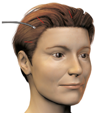
Opening (scarring) of the skin from an endoscopic lift